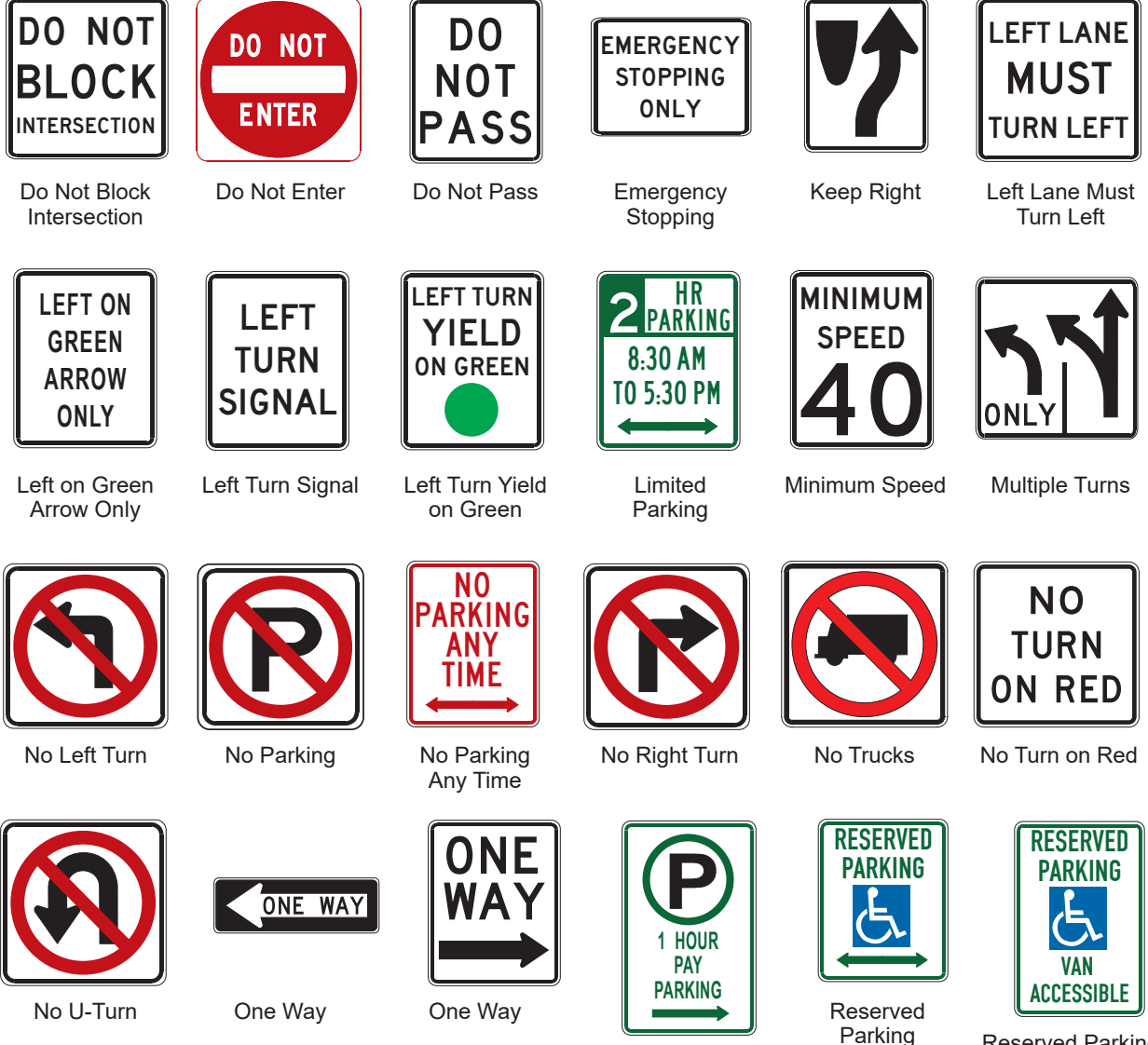
Reserved Parking Van Accessible

Traffic regulation signs regulate traffic speed as well as movement and display rules which drivers must obey. The following signs are examples of Indiana's traffic regulation signs: