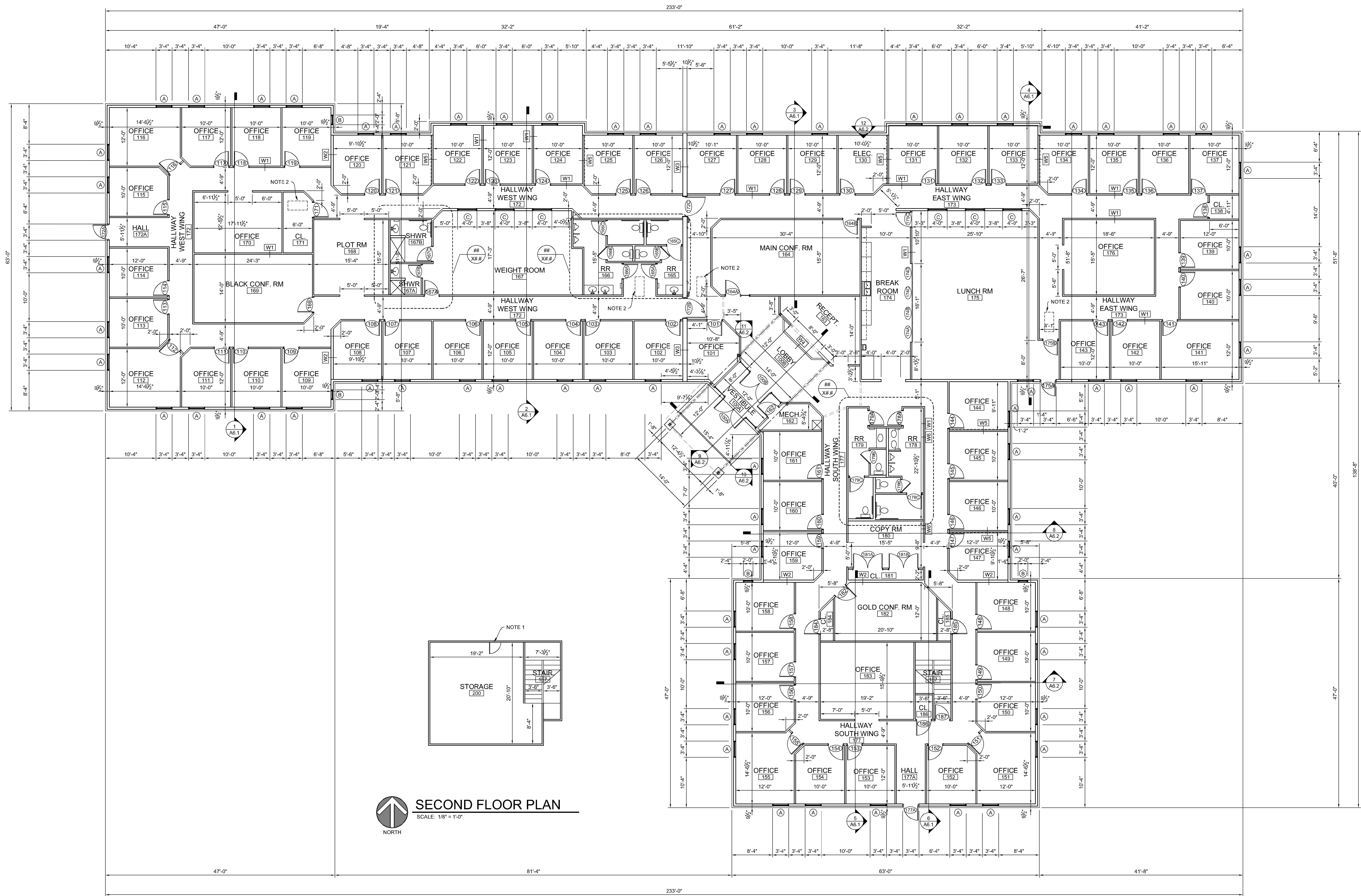
SECOND FLOOR PLAN SCALE: 1/8" = 1'-0" NORTH