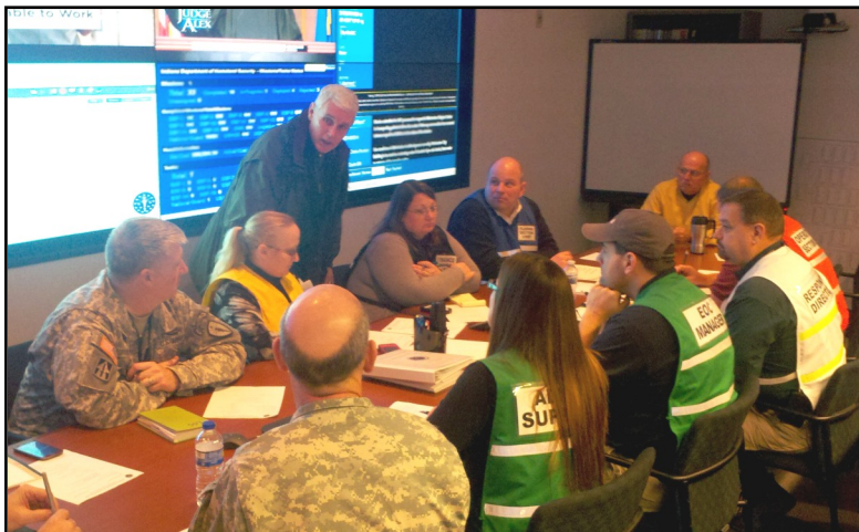
Governor Mike Pence (standing) participates in a conference call with local and state partners during the January 5-8 severe snowstorms. He continually encouraged and thanked public safety professionals for their hard work.

Yellow indicates a travel advisory. This means routine travel or activities may be restricted in certain areas because of a hazardous situation.