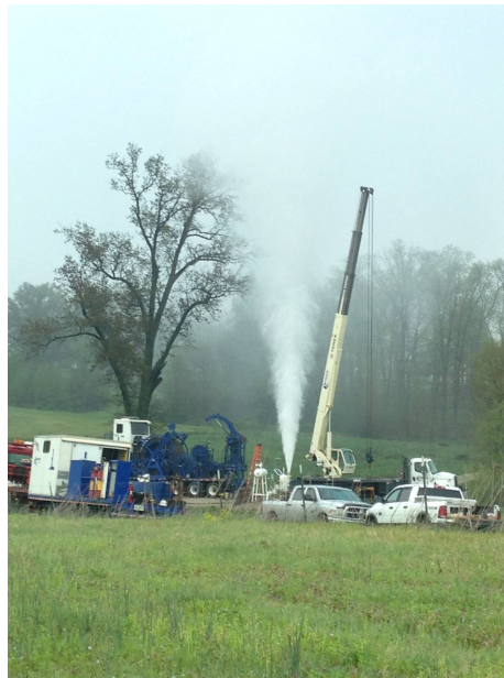
The gas leak, which took place in Green County, Indiana. The leak occurred during routine maintenance.

As a precaution, several homes near the release were evacuated, and local power utilities cut power to nearby lines, leaving about 50