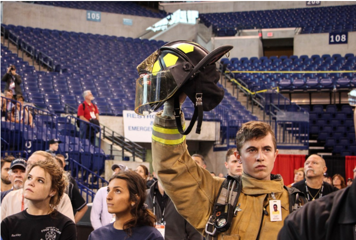
During the 9/11 Memorial Stair Climb opening ceremony, firefighters raised their helmets as a salute.