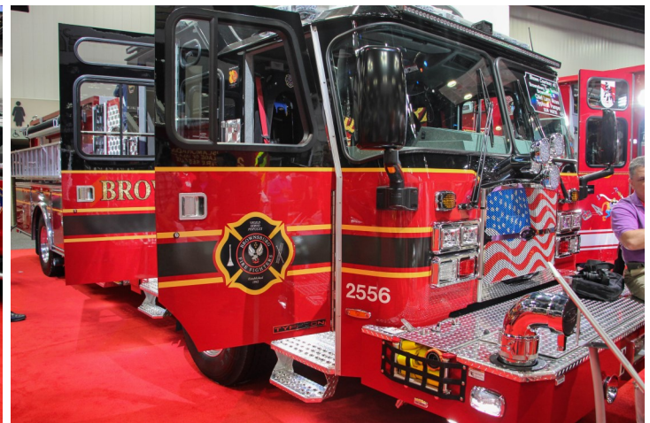
Four Indiana fire engines and ambulances were displayed at FDIC 2017. The vehicles were from Zionsville Fire Department (bottom left), Brownsburg Fire Territory (bottom right), Danville Fire Department (middle right) and Jennings County Board of Commissioners (featured on pages 1 and 6).