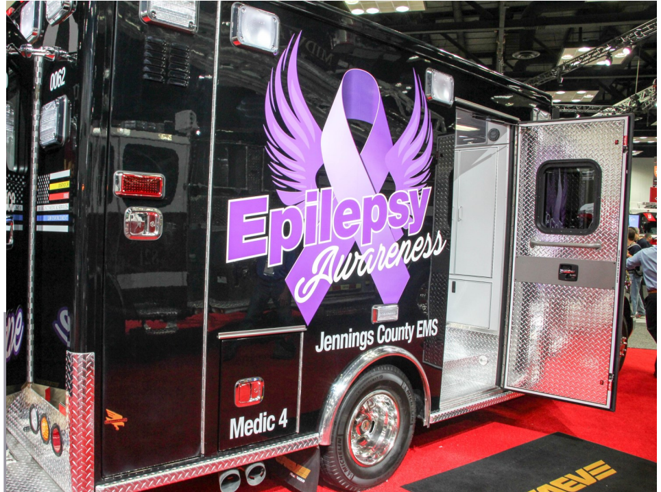
The most recent ambulance, which is dedicated to Epilepsy awareness, was displayed at the 2017 FDIC conference in April.