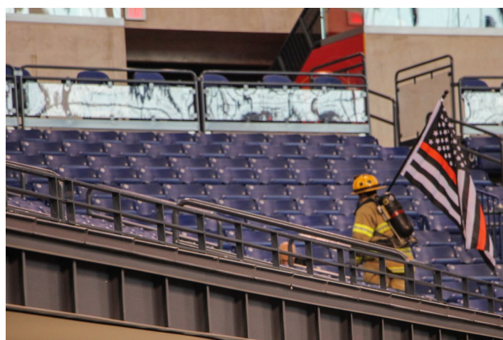
A firefighter carried an American flag during the memorial climb.