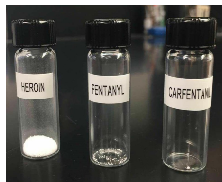
A visual of the dose of heroin, fentanyl and carfentanil needed to kill an average adult.

administering high doses of naloxone can reverse an overdose of carfentanil or fentanyl. In the case of more potent opioids, many more doses of naloxone may be required to reverse an overdose. Responders should be prepared with additional doses of naloxone.