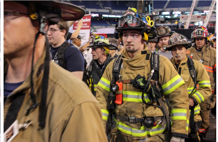
Before the 9/11 Memorial Stair Climb, firefighters lined up and walked through a crowd of supporters.