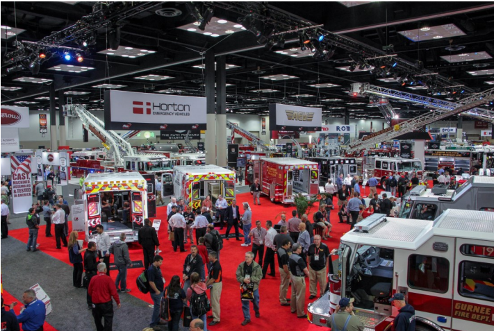
Along with the 33,979 attendees, there were 798 exhibitors at FDIC this year.