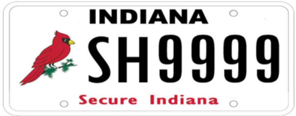
Sale of the Secure Indiana license plates directly funds public safety grants.