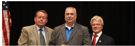
EMS Advanced Life Support Provider of the Year (Non-Fire Department) Three Rivers Ambulance Authority, Operations Division (Fort Wayne)