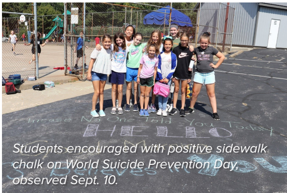
Students encouraged with positive sidewalk chalk on World Suicide Prevention Day, observed Sept. 10.