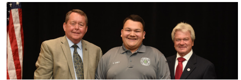
Fire Instructor of the Year (Division) Ohio Township Volunteer Fire Department, Training Division