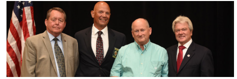
EMS Basic Life Support Provider of the Year (Fire Department-based) Evansville Fire Department, EMS