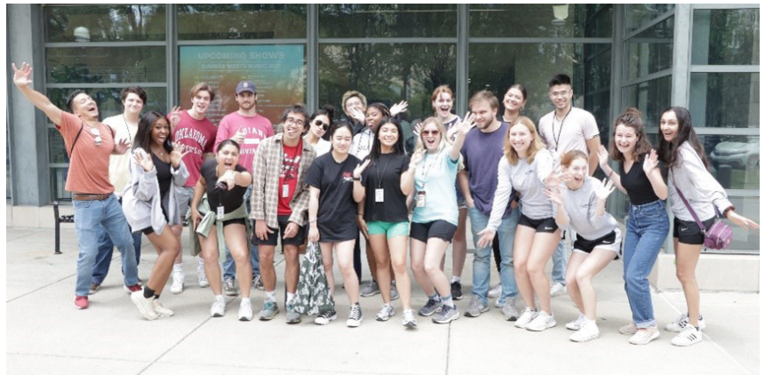
Interns volunteering at White River State Park.