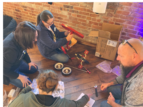
BMV team members building tricycles to donate

Article by the Indiana Bureau of Motor Vehicles