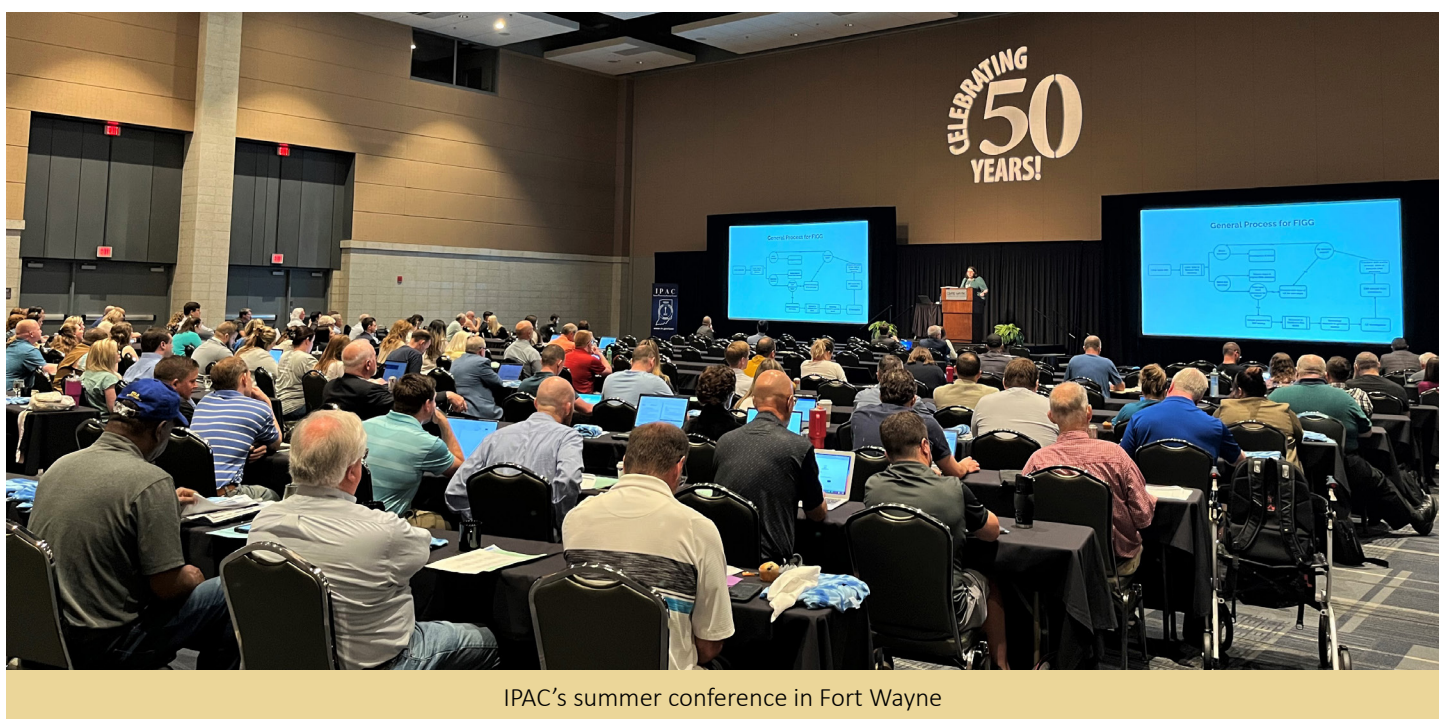
IPAC's summer conference in Fort Wayne