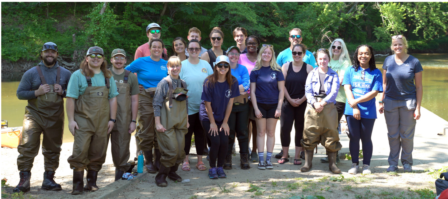
IDEM staff and interns at Fall Creek for electrofishing demonstration.

Article by Indiana Department of Environmental Management