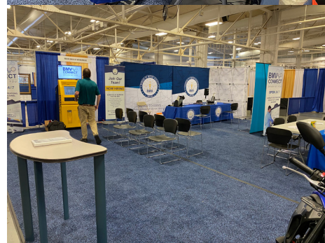
BMV's State Fair booth